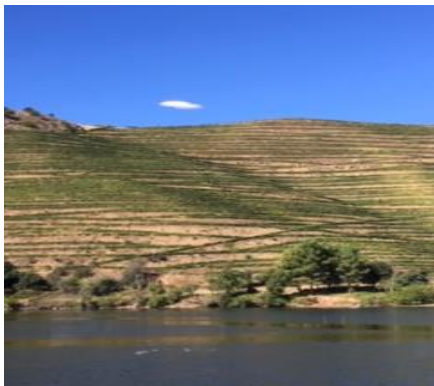
FIGURE 3 DOURO VALLEY