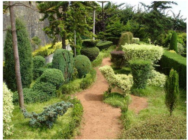
FIGURE 8 JARDIM BOTANICO DA MADEIRA

Following this, we transfer to Funchal airport for our flights back to Lisbon, and homeward.