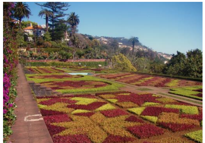
FIGURE 9 JARDIM BOTANICO DA MADEIRA