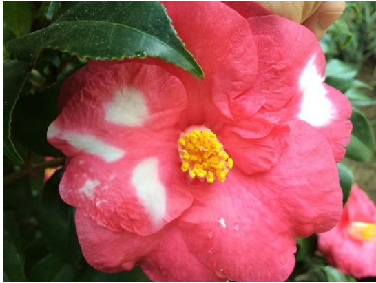
FIGURE 7 CAMELLIA

After breakfast, travel to Lisbon Airport for the return flight to the USA or continue on to Madeira.