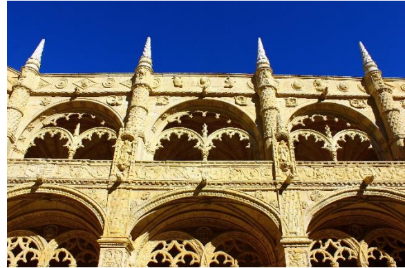
FIGURE 1 HEIRONYMOUS MONASTERY, LISBON