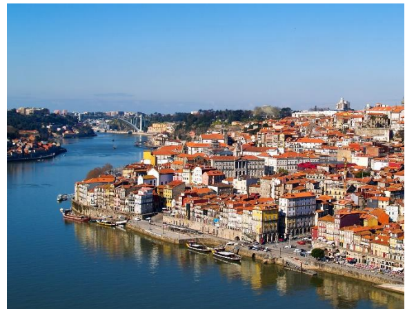
FIGURE 4 CITY OF PORTO