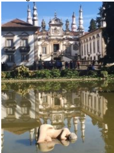
FIGURE 5 MATEUS WINERY