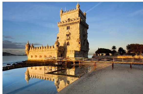
FIGURE 2 BELEM TOWER, LISBON

After lunch, we visit Conimbriga, a Roman Peristyle Garden, one of the most important Roman ruins in Portugal. The excavated site offers an insight into a typical Roman courtyard garden.